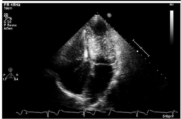
Figure 1 Top: Echocardiographic image of the tricuspid flail leaflet in case patient 1. Middle: Echocardiographic image of the tricuspid flail leaflet in case patient 2. Bottom: Echocardiographic image of the tricuspid flail leaflet in case patient 3.

unknown origin with leucocytosis and increasing C-reactive protein and erythrocyte sedimentation rate. It showed vegetation on the right catheter of the dual-chamber pacemaker (PM) implanted 3 years earlier for brady-tachy syndrome. During the hospitalization, the patient underwent catheter extraction and a repositioning procedure; both were well tolerated. After a few hours, the patient developed heart failure. She was evaluated by an echocardiogram that showed new onset mild tricuspid regurgitation with a flail leaflet of the same valve (Fig. 1, bottom) and an increased systolic pulmonary arterial pressure (40 mmHg). She was treated with intravenous diuretics with benefit. We concluded that the tricuspid valve was injured after the right catheter extraction.